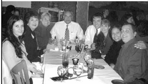
Una agradable reunión se llevó a cabo previo a la Navidad 2002, en la que participaron el personal del CGL, miembros de su Directorio, colaboradores y amigos.

New York, December 18, 2002 - LGC celebrated Christmas with a small gathering where participated LGC staff, Board members, friends and collaborators.